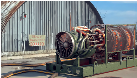
The vrayRE_Denoiser Render Element ( Custom Preset: Strength : 10, Radius : 20)