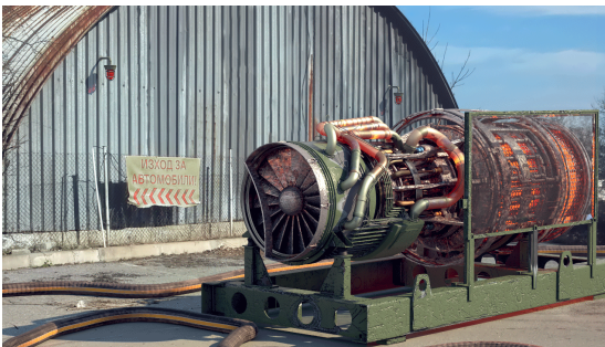
vrayRE_Denoiser Render Element ( Default Preset)