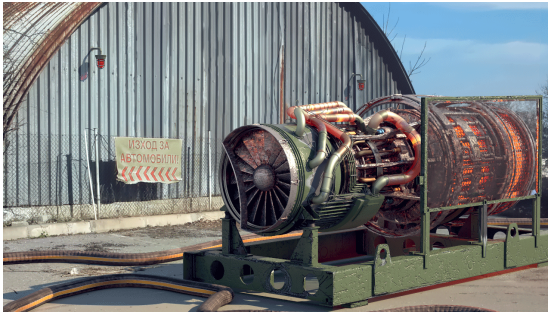
vrayRE_Denoiser Render Element ( Strong Preset)