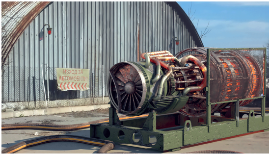
vrayRE_Denoiser Render Element ( Custom Preset: Strength : 5, Radius : 10)