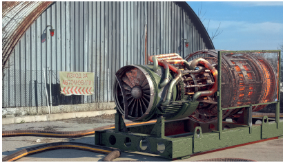
RGB Color Render Element prior to denoising