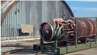
Denoised RGB Color Render Element