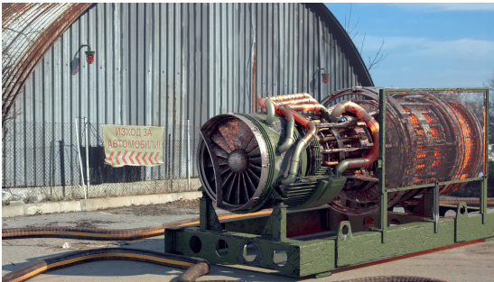
vrayRE_Denoiser Render Element ( Mild Preset)