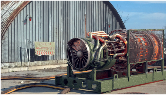
RGB Color Render Element prior to denoising

The example below illustrates how vrayRE_Denoiser works using the presets. A purposely noisy render was set up using the Progressive image sampler with Render Time set to only 10 minutes to leave plenty of noise in the render. To better see the noise level in each image, click the image to see it at full size.